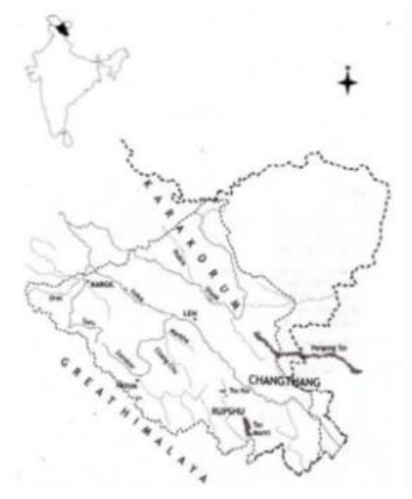
Figure 1: Ladakh map

Ladakh is a region of Indian Trans-Himalaya (Figure 1), for decades, a division of the Jammu and Kashmir State (in 2019, Ladakh become Union Territory of India), geographically classified as "high cold desert" (altitude ranging from 2,300 to 7,672 m.a.s.l.). Politically it is divided into two districts: Leh in the central and eastern parts (area: 45,110 km<sup>2</sup>; 147,104 inhabitants), and Kargil (area: 14,036 km<sup>2</sup>; 143,388 inhabitants), in the northwest. For many centuries, local population has led a self-reliant existence mainly based upon subsistence agriculture, pastoralism and caravan trade. After China-India war in 1962, the militarization of the area, the modernization due to governmental programs and the progressive opening to external influences and