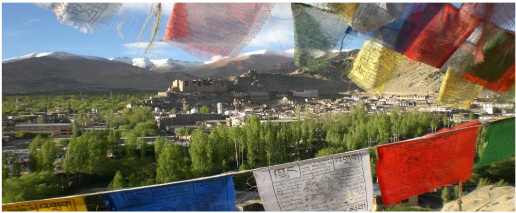
Figure 2: Leh valley and town.

resources, such as tourism, have characterized the development paths (Rizvi 1996). Tourists are attracted in Leh district for its mountainous landscape (Figure 2), environment, high altitude lakes, Indus River, beautiful villages and Himalayan people living in scenography valleys, filled of Buddhist heritage sites. All makes this region a great place for adventure sports, sightseen, cultural and religious tourism, and for national, also "to escape from the heat and humidity of Indian plains" (Pelliciardi 2010:15) during summer.