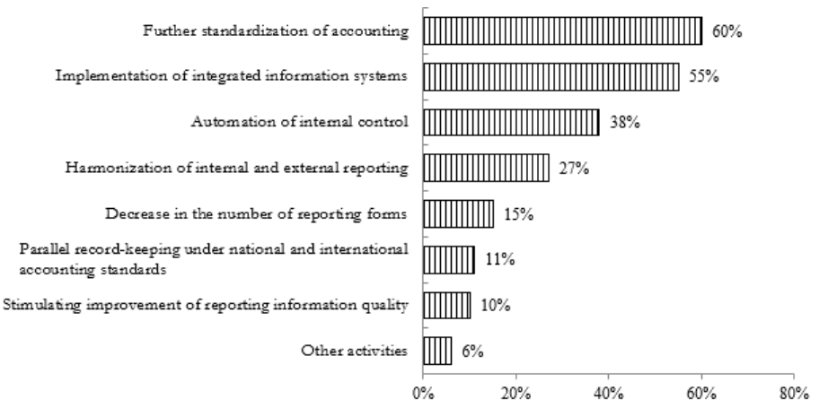
Figure 1. Activities that enterprises are willing to implement to improve the quality of financial reporting Source: Authors' compilation using information from the official site of PwC (2016)

According to the "Reporting Survey" conducted by the audit firm "PricewaterhouseCoopers", 65% of surveyed managers of enterprises noted that the highest priority in the preparation of financial statements is the quality of the information presented in it, while the optimization of costs and time to generalize and obtain reporting indicators is important for 29 and 6% of respondents, respectively. High requirements to the quality of financial reporting are the result of the growing importance of public image of companies and constant monitoring of their development by investors. At the same time, 25 and 44% of respondents respectively highly appreciate the quality of information provided in the financial statements of their companies, and 85% of companies plan to take further measures to improve the quality of financial reporting. Such measures for the majority of enterprises are further standardization of accounting, implementation of integrated information systems, automation of internal control, harmonization of external and internal reporting, etc. (Figure 1).