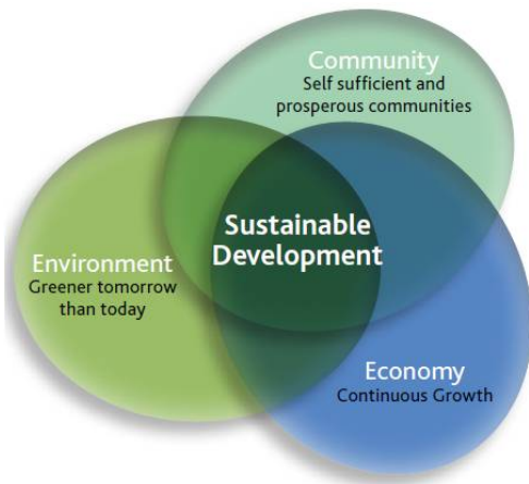
Figure. 3. Components of sustainable development

The three pillars of sustainable development – economic growth, environmental management, and social inclusion are crucial and occur across all sectors of development, from cities facing fast urbanization process, infrastructure, energy development and use, water availability, as well as transportation (Girardet, 1999).