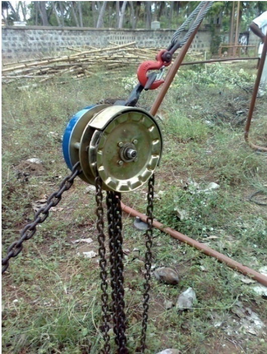
Figure.4 Chain pulley block