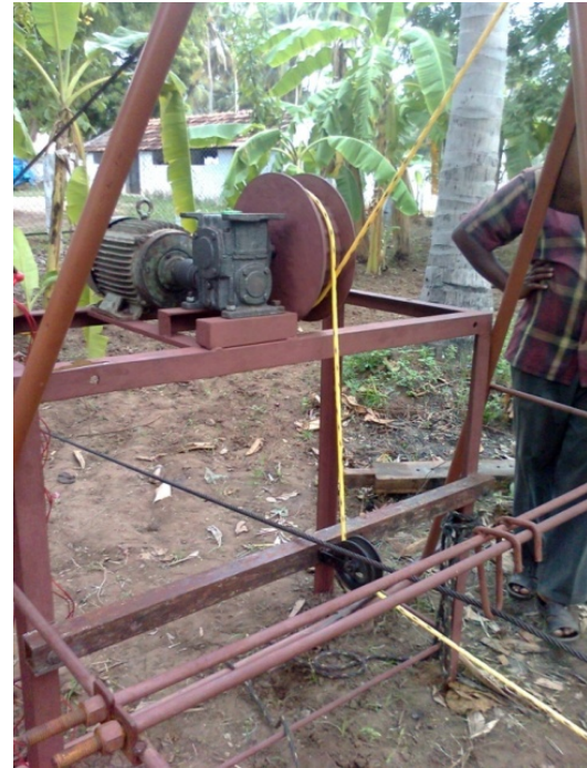
Figure.5 Winch with 2 H.P motor