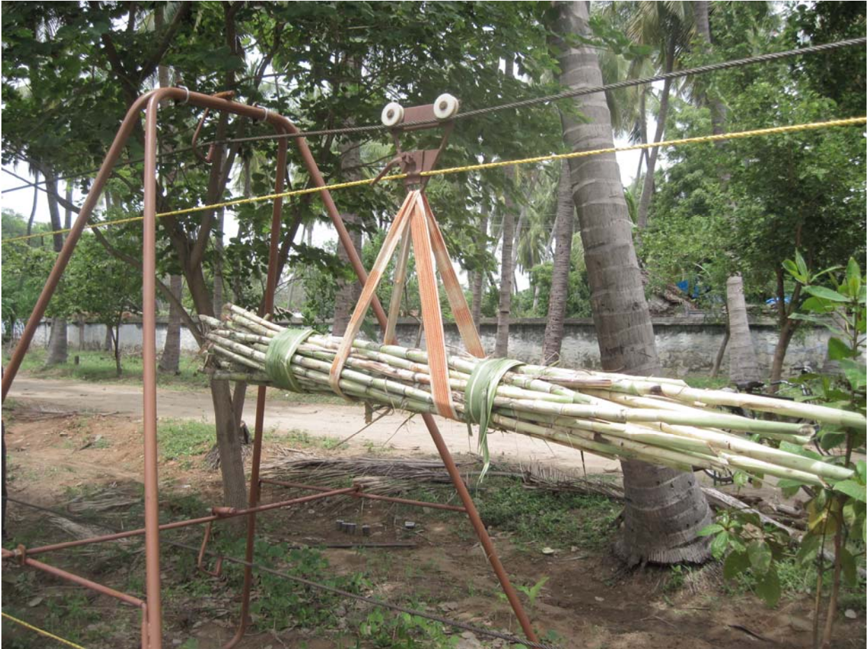
Figure.1 Photograph of portable cableway