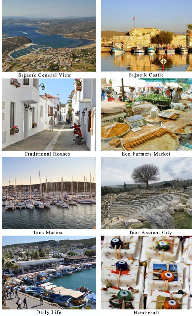
Figure 1. Photos from Sığacık Settlement

Sığacık is the showpiece of Seferihisar, which assumed the title of Turkey's first Cittaslow town in 2009 and contributes to the development of Seferihisar tourism. In addition, as a part of "Sığacık Old City Streets Improvement Project", restoration works were carried out for 12 streets and market place in Kaleiçi and the perceptibility of the historic pattern of Sığacık is provided.