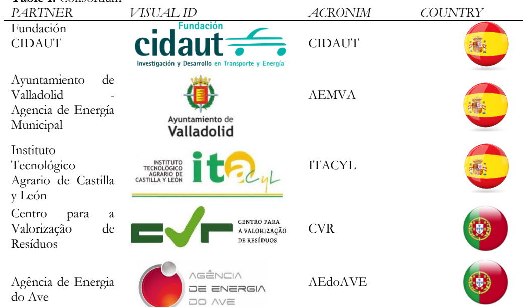
Table 1. Consortium ~

Faced with the planned exhaustion of fossil energy, its cost and impacts on global climate change, the development of new forms of energy, ecological and renewable, is a commitment of all countries signatories to international agreements. Although the position of the cross-border area in relation to this objective is above the European average, the project represents a way of maintaining a sustainable increase in biomass available for energy purposes, allowing for further progress in the use of renewable energies.