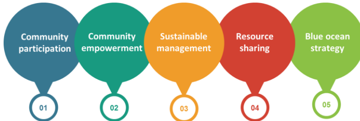
Figure 2 The five instructions

The five instructions associated with the social resilience present the performance of the social impact in the region and even analyze the operations of institutions in the regional development. Furthermore, it is crucial that the operations of institutions are able to be distinguished under the individual instructions. Through the cautious classification, the outcome of institutions could be accurately pointed out the weakness and strength between the external and the internal. Despite the five instructions enable to express the directions of weakness and strength, the approach would not obviously display the causes. Accordingly, the instructions must link to a practical analysis— it dissects the factors from holistic aspects. That is the reason why