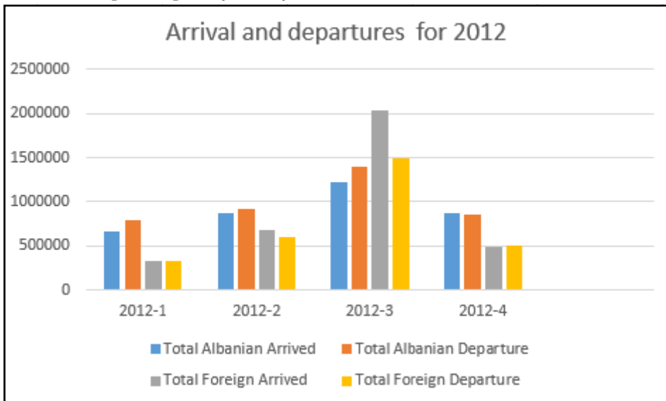
Fig. 3, Arrival and departures for 2012