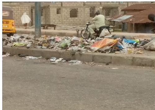
Fig. 1 Pictures displaying the current state of Minna (2022)