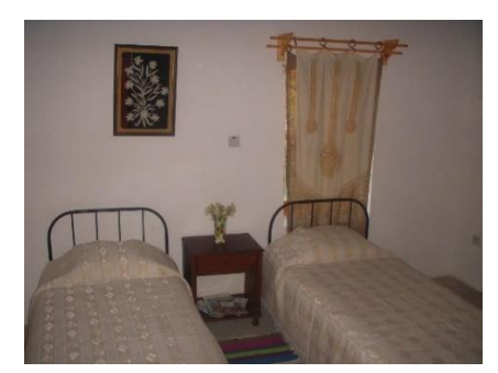
Figure 15. Ay Phodios Guest House (Author - 2020)

Furnishing: The traditional accommodation buildings are furnished with island's unique and authentic elements. There are authentic wooden, iron and brass beds, engraved wooden crates, wooden armchairs and tables in the bedrooms. Rooms also have rugs and handcrafted curtains. Authentic armchairs and couches, coffee table, sideboard, showcase and shelves which made wooden are used in reception and sitting areas of common spaces. Wooden tables with turned legs and woven chairs, both of which are still used in the traditional island life, were placed in dining areas (Figure 15, 16).