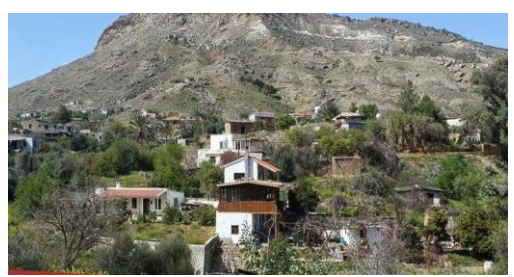
Figure 1. Büyükkonuk (Komi Kebir) village <a href="https://www.gundemkibris.com/sinema/baglikoyde-3-eko-gun-pazar-gunu-duzenlenecek-b107572.html">https://www.gundemkibris.com/sinema/baglikoyde-3-eko-gun-pazar-gunu-duzenlenecek-b107572.html</a>)

Although Yeşilyurt (Pendaya), Kumyalı (Kumyalik) and Yeşilırmak (Limnidi) villages are not covered under our research, there are two accommodation buildings constructed as an extension to existing buildings in Yeşilyurt and Kumyalı that each has one; and two new accommodation buildings constructed in reinforced concrete structure exist in Yeşilırmak. The majority of ecotourism accommodation buildings in North Cyprus are boutique hotels that used to be traditional old housing units. The new buildings were designed with local architectural characteristics through traditional materials and forms; and they were also furnished with authentic accessories to be compatible with ecotourism.