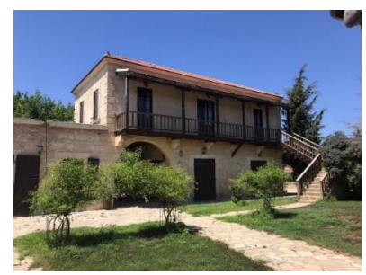
Figure 5. Karpaz Arch House