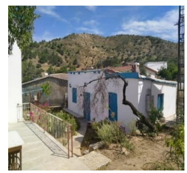
Figure 10. Ambelikou Guest House (Author - 2020)

Façade: They have simple façade in general with rectangular wooden door and windows. Flat, half circle and pointed arches built with stones add momentum to the façades (Figure 11, 12).