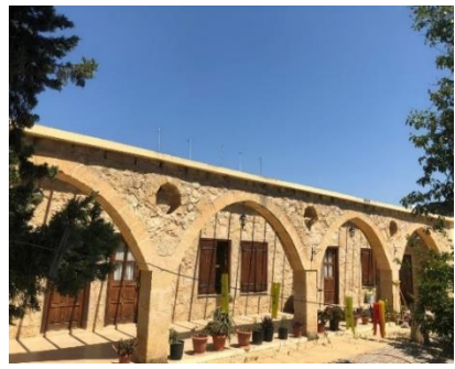
Figure 11. Galifes Guest House

Façade: They have simple façade in general with rectangular wooden door and windows. Flat, half circle and pointed arches built with stones add momentum to the façades (Figure 11, 12).