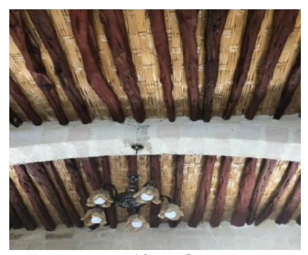
Figure 13. Revakh Ev Guest House