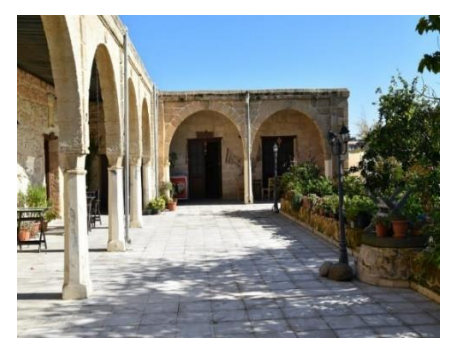
Figure 12. Revakh Ev Guest House

Floor and Ceiling: At the time of restoration, ceramic material is used on the floors while woven straw mat on rectangle/circle wooden beams with traditional construction techniques is applied on ceilings (Figure 13, 14)