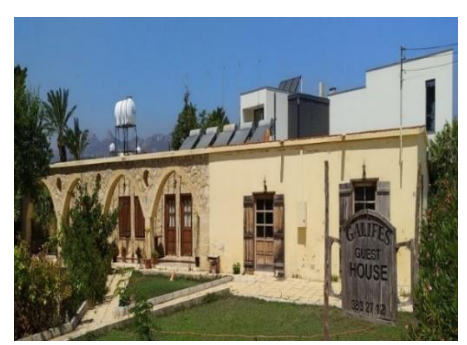
Figure 9. Galifes Guest House (Author - 2020)