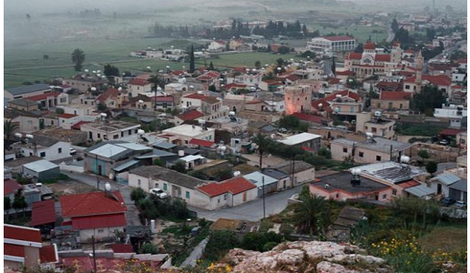
Figure 3. Dipkarpaz (Rizokarpaso) village (Author - 2020) (https://www.havadiskibris.com/onlar-harciyor-biz-oduyoruz/)