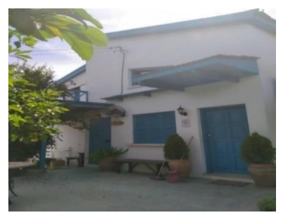
Figure 4. Ambelikou Guest House (Author - 2020)

Location and Number of Floors: Traditional accommodation buildings in ecotourism villages are mainly located on streets integrated with the traditional village lifestyle and nature. They are low rise with courtyards that most of them are single floor buildings. Courtyards facilitate the outdoor functions during the traditional island life (Figure 4, 5).