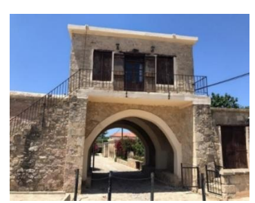
Figure 7. Karpaz Arch House

Layout Plan: The related accommodation buildings are designed almost as rectangular in parallel with traditional lifestyle. Different functions are separated, and they have simple indoor organisation (Figure 8).