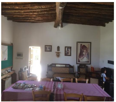
Figure 14. Galifes Guest House

Furnishing: The traditional accommodation buildings are furnished with island's unique and authentic elements. There are authentic wooden, iron and brass beds, engraved wooden crates, wooden armchairs and tables in the bedrooms. Rooms also have rugs and handcrafted curtains. Authentic armchairs and couches, coffee table, sideboard, showcase and shelves which made wooden are used in reception and sitting areas of common spaces. Wooden tables with turned legs and woven chairs, both of which are still used in the traditional island life, were placed in dining areas (Figure 15, 16).