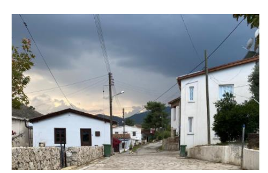
Figure 2. Bağlıköy (Ambelikou) village