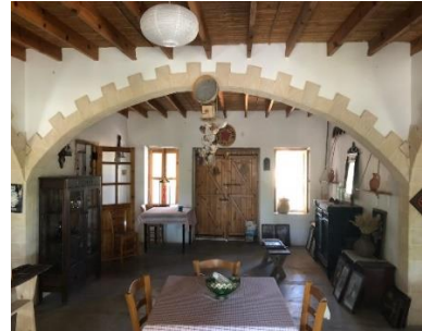
Figure 16. Ay Phodios Guest House (Author - 2020)