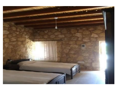
Figure 6. Galifes Guest House (Author - 2020)

Construction Materials and Technique: They are mainly masonry buildings constructed with traditional construction materials like stone, adobe and wood. Stone and adobe are used on walls, arches, door-window frames where as railings, ceiling carrier systems, shading components, and door-window frames are made of wood (Figure 6, 7).