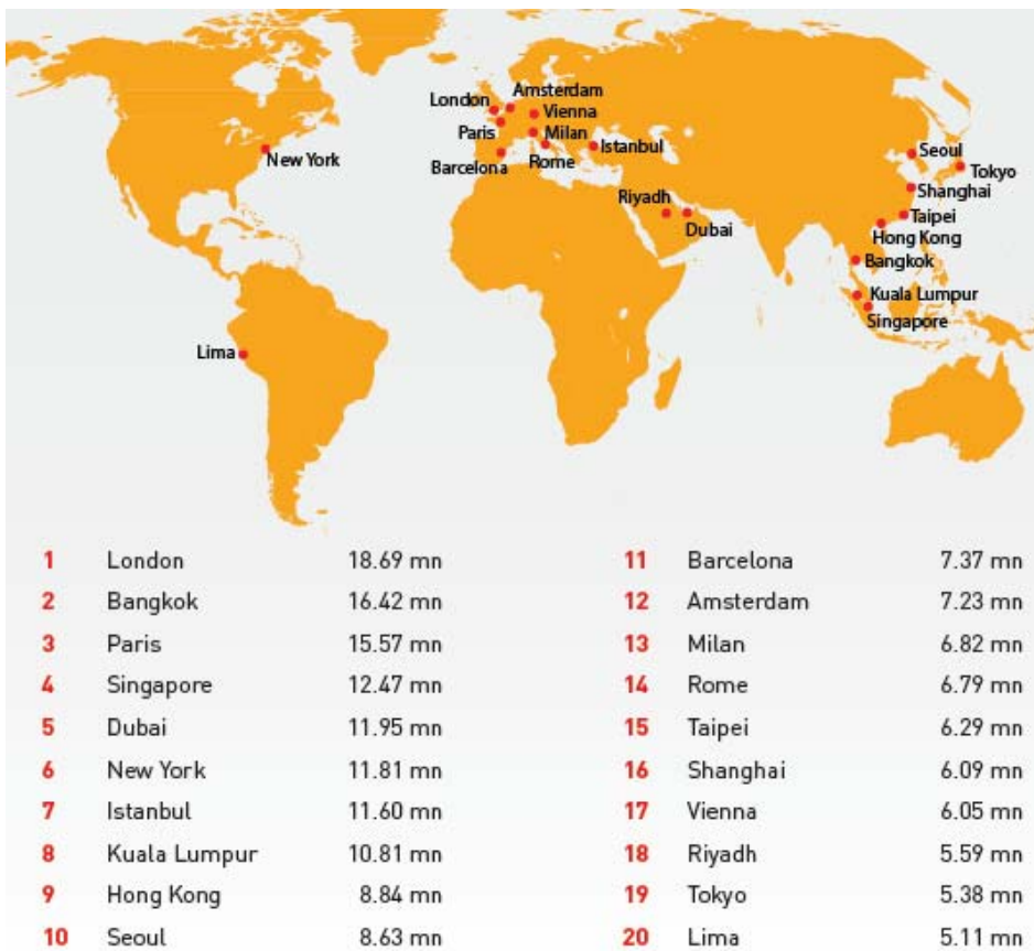
Figure 2: Global Top 20 Destinations for International Travellers for 2014.

Furthermore, according to the MasterCard Global Destination Cities Index (2014), Dubai ranks fifth among top global destinations for international travellers, rising two slots from the seventh position in 2013 (See Figure 2 & Table 1). Dubai, not only jumped ahead of New York and Istanbul to take the fifth place, but it already welcomed almost 12 million overnight international visitors in 2014, meaning rising by 7.5 per cent from 2013. Paris and Singapore, for example, with 1.8% and 3.1% growth rates respectively, are both eclipsed by Dubai's 7.5% growth rate. If their present growth rates are to continue, then Dubai would surpass both Paris and Singapore within five years only (MasterCard Global Destination Cities Index, 2014).