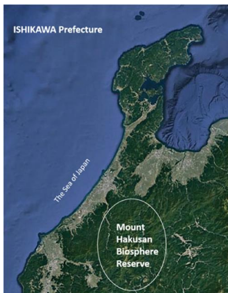
Figure 2. Mount Hakusan Biosphere Reserve area

Shiramine village, is a small village in a mountainous area to the North-East site of Mt. Hakusan on the 500m altitude along the Tedoru River terrace, with the total area 222km 2 (12), (Figure 3), and it is included into the transition zone of MHBR. The main differences of the region from the other villages, is that the area has almost no flat lands, and is considered to be the foothills of the Mt. Hakusan with lots of snow precipitation that can reach 7 meters. Mt. Hakusan is a volcano, with the last eruption recorded in 1579. Due to its location, next to the Hokuriku coast, in winter, seasonal dry northwest winds flows from the Eurasian continent and moisture from the warm Tsushima Current from the Sea of Japan, creates the heavy snowfalls specific to the region. Most of the snow melts in summer and flows downhill by forming water systems, and Shiramine is considered to be one of the main water resource sectors of the Ishikawa Prefecture. Heavy snowfalls and different seasonal temperature creates the unique and diverse alpine environment with endemic flora and fauna. The vegetation is distributed with the forest zones of summer green broad-leaved (Japanese beech zone) which comprises the important vegetation element in Mt. Hakusan. This area is also densely inhabited with large mammals like Asiatic black bear, Japanese serow, Japanese macaque, Golden Eagle and mountain Hawk-eagle.