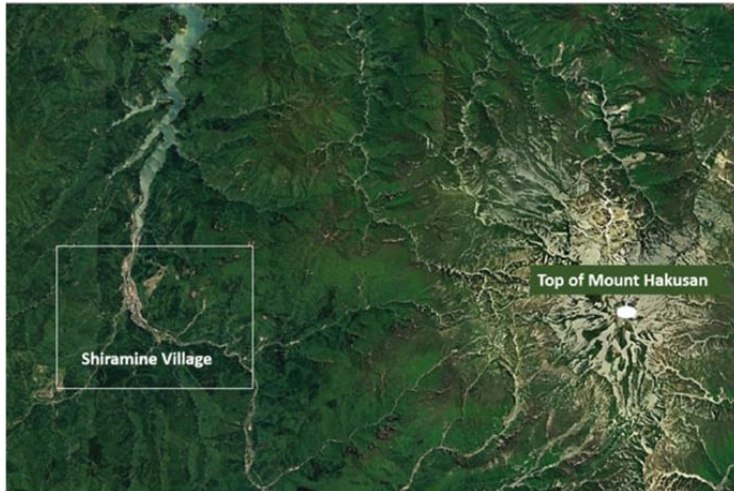
Figure 3. Shiramine Village