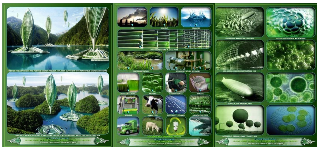
Figure (1): floating Algae farm inspired from the shape of seaweeds found in ocean that recycle the CO_2 for the bio-hydrogen flying airship