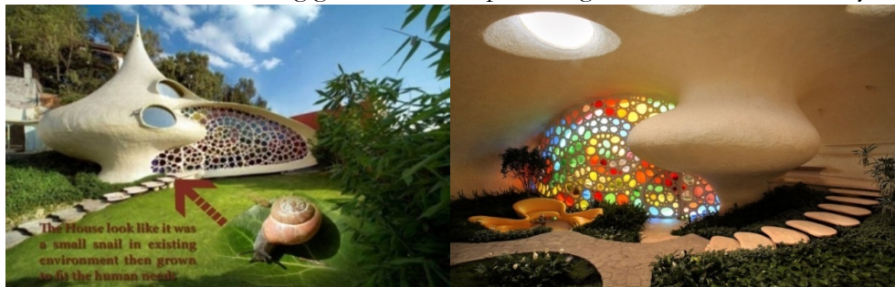
Figure (6): The Nautilus House: Live In A Giant Designer Snail Shell, 2006

The Nautilus House is a gigantic shell-shaped design located in Mexico City.