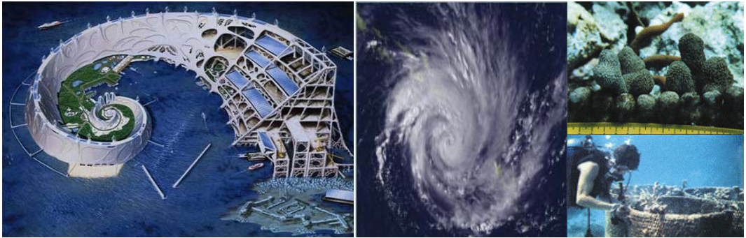
Figure (4): The city takes the form of the swirling of the sea, showing how to such CO_2 and make it as building material; Source: http://www.globalcoral.org/Ocean-Grown%20Homes.htm