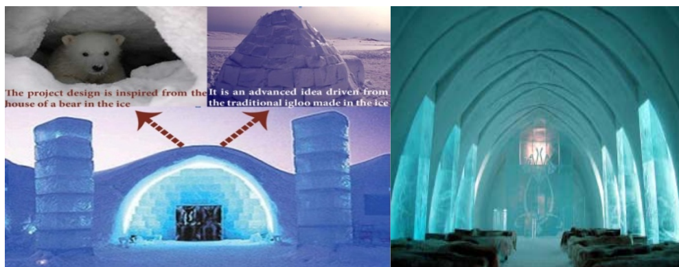
Figure (5): The Ice Hotel Sweden